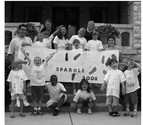
Campers (wearing Camp Sparkle t-shirts they created) and volunteers pose for a group shot during Camp Sparkle at the Gilda’s Clubhouse.